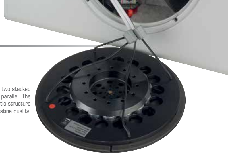
The MSW uses two stacked voice coils wired in parallel. The chassis and magnetic structure are of pristine quality.

In fact, it's a low-budget entry into the extraordinary Manger world of sound.