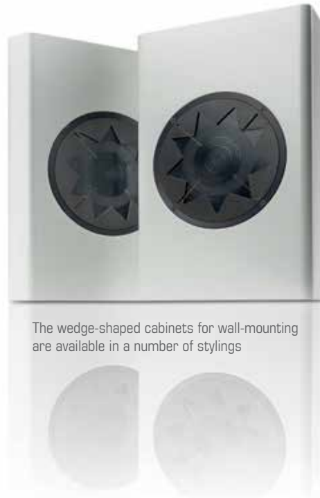
The wedge-shaped cabinets for wall-mounting are available in a number of stylings

bending waves around the voice coil. This way the Manger avoids the energy-storing force of the mass-and-spring system and the resulting time delay. Excellent transient behavior is one of the MSW's main features. The bending wave design is suitable for all frequencies, by the way, a division into high, mid and bass frequency loudspeakers is superfluous. The Manger is everything in one box, a true fullrange speaker. Only the bass range is limited because the transducer can only move a certain amount of air. Above 80 Hz it works almost perfectly, though, far beyond the listening range of 20 kHz. Manger's loudspeaker design normally combines the MSW with a woofer. This applies for our much valued c1 as well. The current wall-mountable w1 dispenses with a separate bass speaker. With its shallow sealed enclosure and a volume of only 5 liters it huddles unobtrusively against the wall. The inside has been carefully damped using