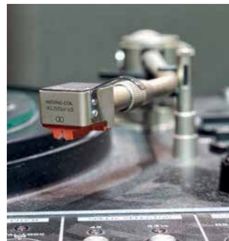
Alternative: The Sony PS-X9 with matching cartridge was Japan's response to the dominance of the heavy EMT studio drives. Mark Ernestus sometimes uses a slightly modified model in a fixed installation.